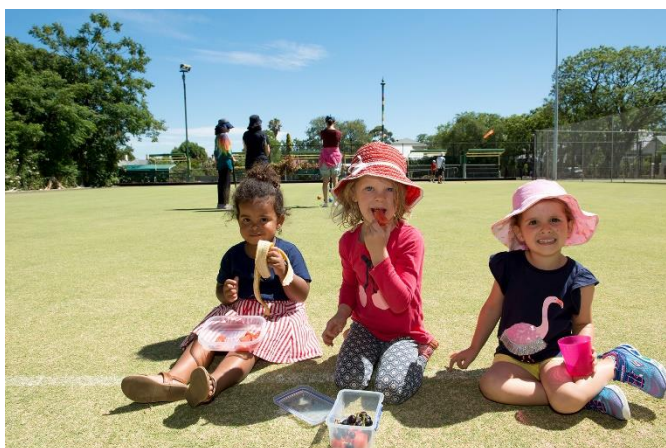
Some young players enjoying morning tea.