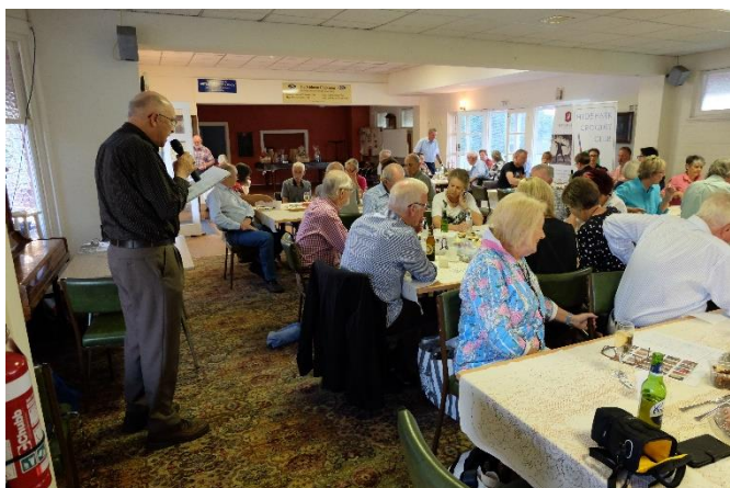
Thinking caps on at the quiz night