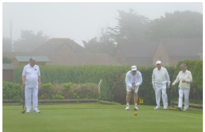
Can't see the hoop, it's over there somewhere.

Our second competition was against the Budleigh Salterton Croquet Club. This club was approximately 5 miles from Exmouth, overlooking the coast. After some tough competition (and sea mist in the morning), we won the day 14 to 10.