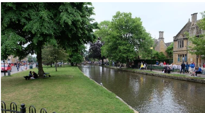
Bourton on the Water, what a pretty place

The following day, we toured some of the Cotswold villages by bus, and learned many interesting facts about the area from our resident expert guide, Andrew Larpent.