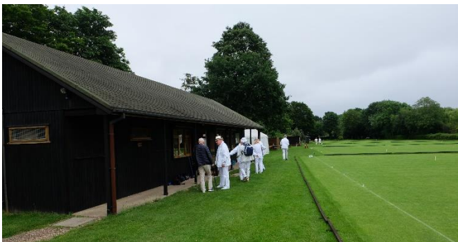
Arriving at Surbiton Croquet Club

On Tuesday morning the group travelled 12 miles to the Surbiton Croquet Club for our next competition. After a great morning of croquet in sunny weather our group lost to the local team 28 to 33. After a wonderful lunch, social games continued into the afternoon.