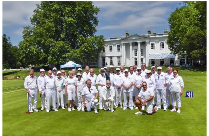
Members and visitors at the Hurlingham Club

On Friday morning the group assembled to travel to the Hurlingham Club for our final competition. This club is a combined sports club similar to ours, just a “little” bit bigger. After meeting the local members and selecting mallets, it was onwards to the perfectly manicured lawns. The competition was close, but at the end of the morning we took the day 12 ½ to 11 ½ matches. A silver service lunch followed and then social croquet in the afternoon.